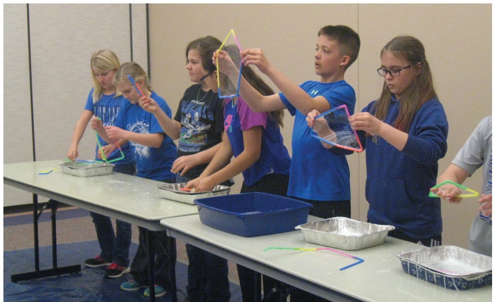
Students from Pierce Elementary studied Bubbleology in one of their sessions. This session was presented by NRCS staff from across the district.

Elkhorn H 2 O Daze is sponsored by the Lower Elkhorn & Upper Elkhorn Natural Resources Districts, the Natural Resources Conservation Service, the University of Nebraska Extension, the University of Nebraska Conservation & Survey Division, & Nucor.