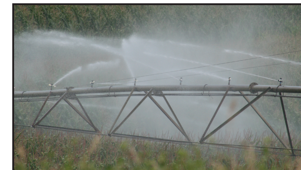
Contact your local NRCS office or the LENRD office for more information on cost-share to fund flow meters as well as other program options and additional incentives by June 16th .

Visit www.lenrd.org/flow-meters for more information.