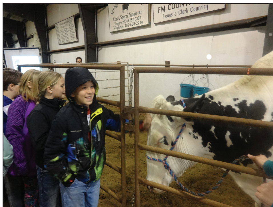
Students from Pierce Elementary were excited to pet the animals at the first "Life on the Farm" event for Pierce, Antelope, and Knox County schools.

The event is modeled after a similar event the UNL Extension in Madison County has been hosting for 15 years. The committee is already planning next year's event.