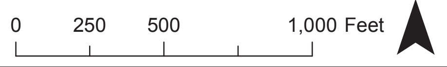
Water Quality Basin