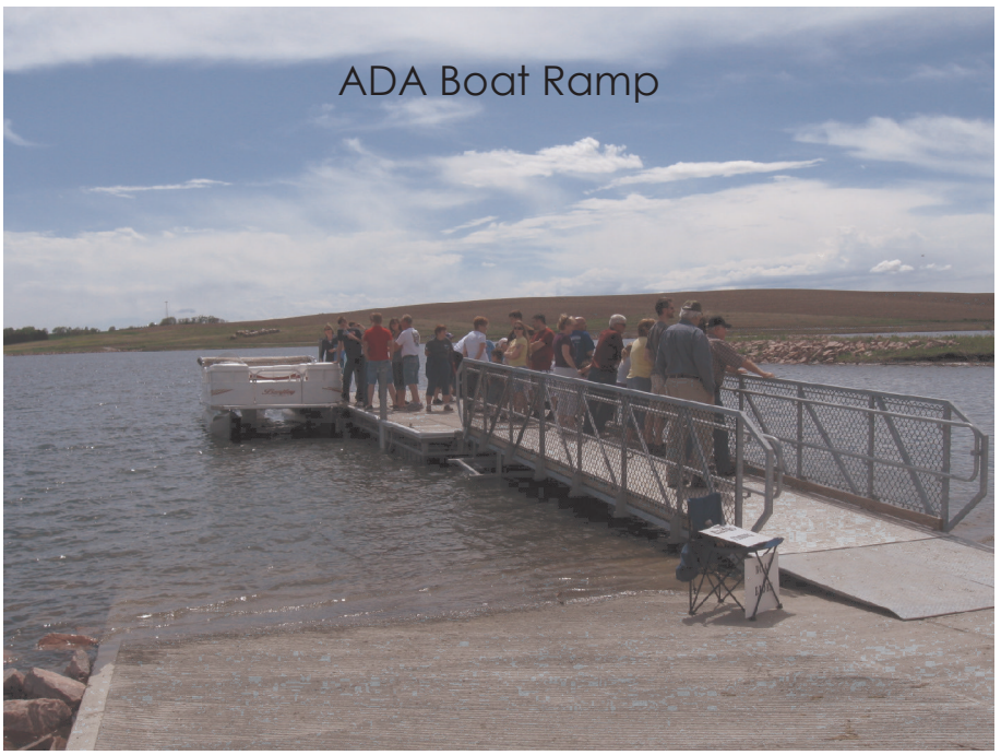
ADA Boat Ramp